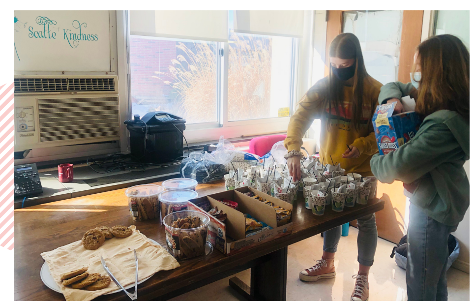
Student Government spreading the Love!